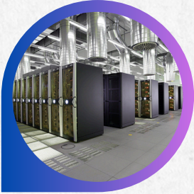
Data Centre & IT Infrastructure