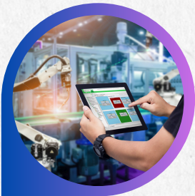
Industrial Automation & Manufacturing