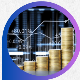
Banking & Financial Services