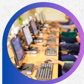
Educational Institutions & Laboratories