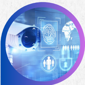
Security & Surveillance Systems